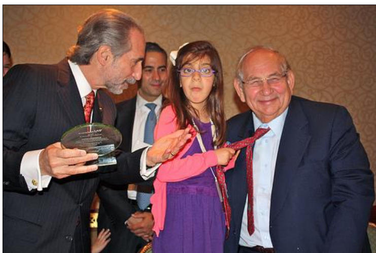
An award winning young service user holding tightly onto Prince Ra'ad