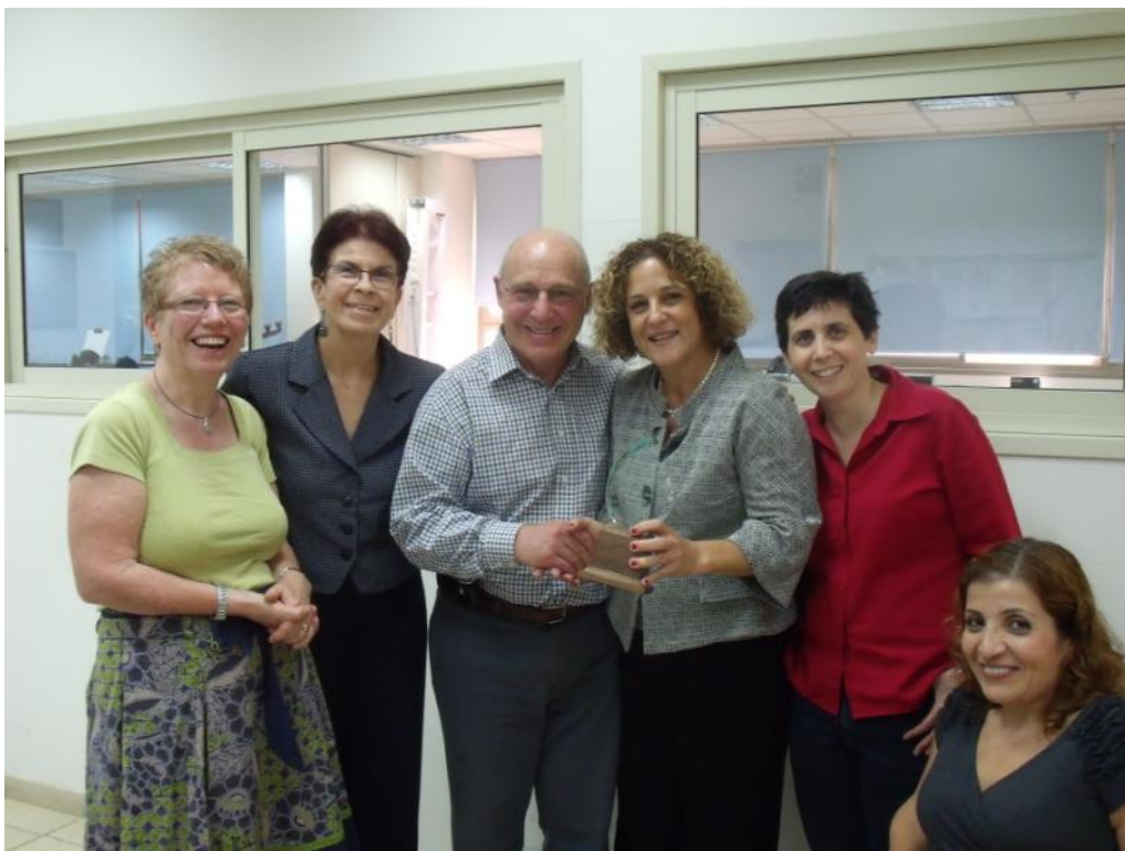
Colleagues from the CTEC Centre at Petah-Tikva being presented with their award